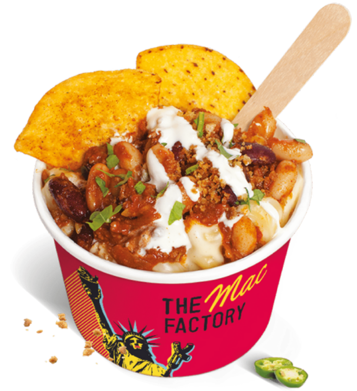
The Latino of Macs. Smokey Chipotle beef chilli con carne, tortilla chips, sour cream, jalapeños that's sure to get you on your feet!