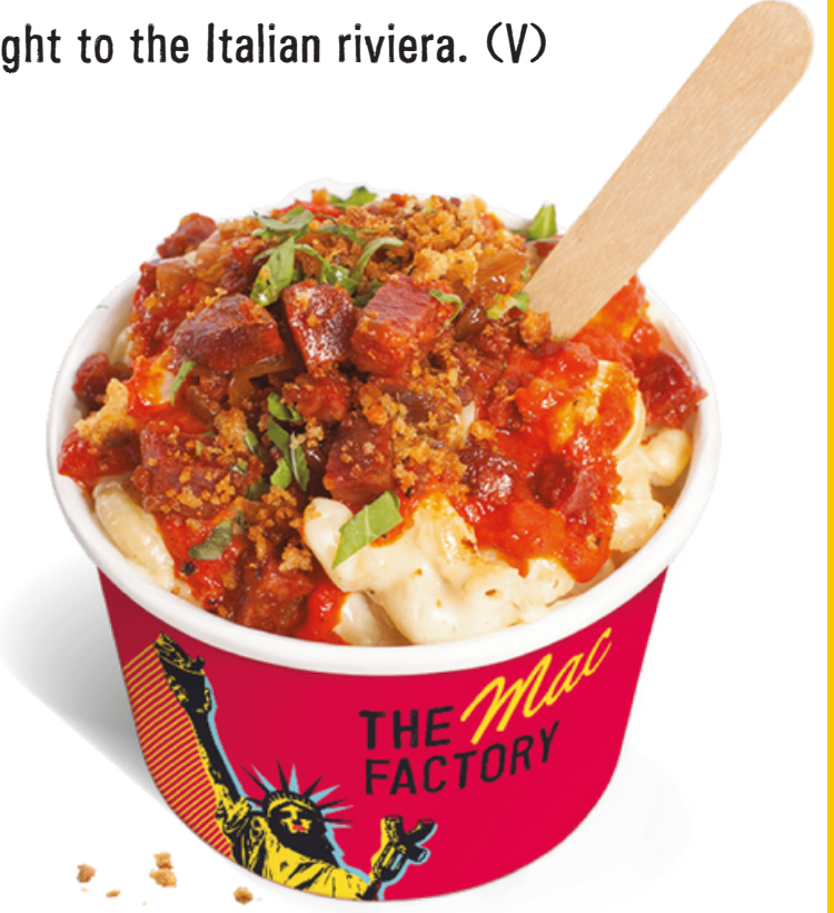
. The Spicy Chorizo will knock your socks off, but paired with Harissa and caramelised onion it perfectly warms the soul.