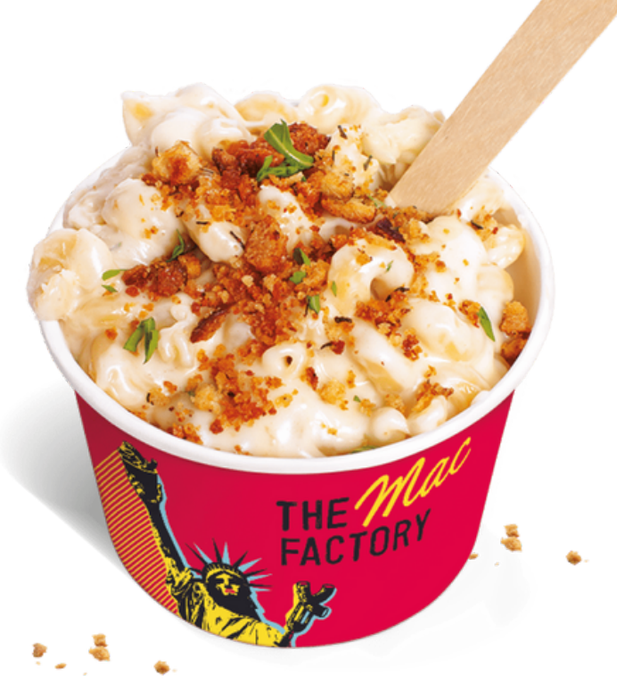
Our all-time classic; scrumptious and perfectly cheesy. Made with our classic cheese blend of Mature Cheddar, and Mozzarella. Cheesetastic! (V)