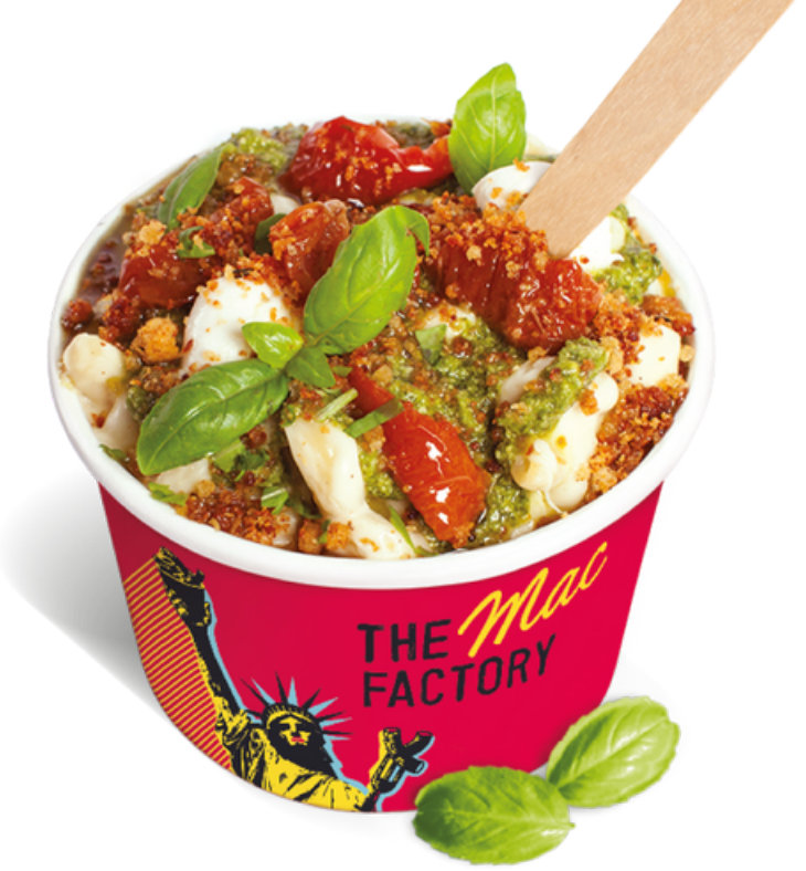
Like a dip in the Mediterranean! This basil pesto Mac with semi dried tomato, baby mozzarella balls will take you straight to the Italian riviera. (V)